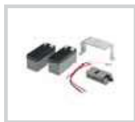
BRAINY24.CB Accessory with CBY.24V battery charger, 1.2 Ah batteries and support bracket.