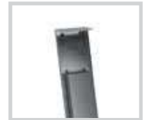
DA.LB Galvanized column for outdoor installation of LB box.