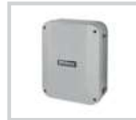
XLB.CB Battery box fitted with universal bracket and cables. IP54.