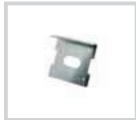
DU.9990 Covering plate for DU.V90.