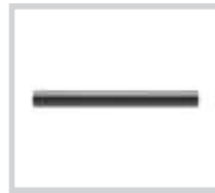
BILL50.CO Telescopic stem cover accessory.