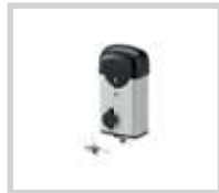
E.LOCK 230 Vac vertical electric lock, supplied with counterplate.