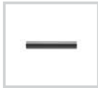
BILL30.CO Telescopic stem cover accessory.