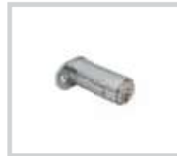
E.LOCKSE Extended cylinder for E.LOCK electric lock. It allows unlocking gates up to 55mm-thick from the outside.