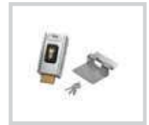
DU.V96 12 Vac/dc vertical electric lock, supplied with counterplate. Permits internal/external release.