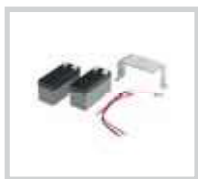
BRAINY24.CB-SW Accessory equipped with 1.2 Ah batteries and support bracket.