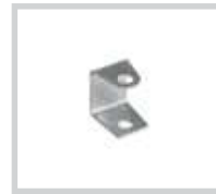
SNC.90 Bracket for 90° cable orientation. Package of 2 pcs.