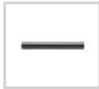
BILL40.CO Telescopic stem cover accessory.