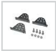
B.SR Multiposition brackets for one operator.