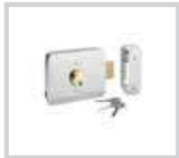
DU.V90 12 Vac/dc horizontal electric lock, supplied with counterplate. Permits internal/external release.