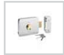
DU.V90 12 Vac/dc horizontal electric lock, supplied with counterplate. Permits internal/external release.