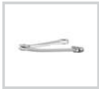
BA Single arm.