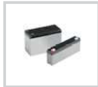
DA.BT2 2.1 Ah 12 Vdc Battery. DA.BT6 7Ah 12 Vdc Battery.