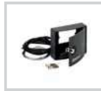
MB.SE Externally fitted anti-intrusion cable lock device which allows the gate to be unlocked from outside.