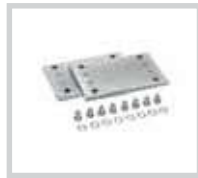
MB.CP2 Set of counter plates for two operators, suitable for the installation on columns made of stones.