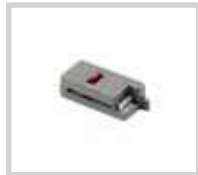
CBY.24V Battery charger card. The CBY.24V card allows charging two different types of nickel metalhydrate and lead batteries.