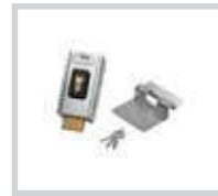
DU.V96 12 Vac/dc vertical electric lock, supplied with counterplate. Permits internal/external release.