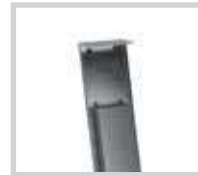
DA.LB Galvanized column for outdoor installation of LB box.