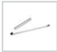
BS Sliding arm.