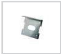
DU.9990 Covering plate for DU.V90.