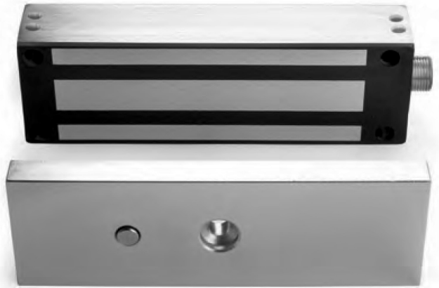
Gate Lock - AEM/GATE/F/S